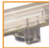
CLIP FIXING WITH MAGNET OR SCREW