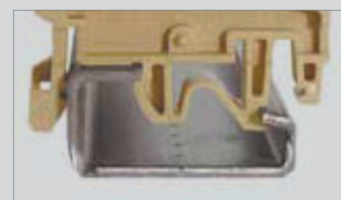
"G 32"-type rail